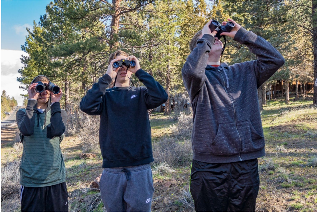
Sisters High School Students on a birding field trip

East Cascades Audubon Society of Bend has a host of information on its website ( http://www.ecaudubon.org ) like local birding locations and check-off lists to get you started. Check out their newsletter to find out what's going on and to meet with other like-minded nature observers. The Deschutes Land Trust ( www.deschuteslandtrust.org ) also offers a number of birding walks on their preserves. The Oregon Birding Association has endless information on its website ( www.oregonbirding.org ) that will make you want to grab your binocs and camera and head outdoors.