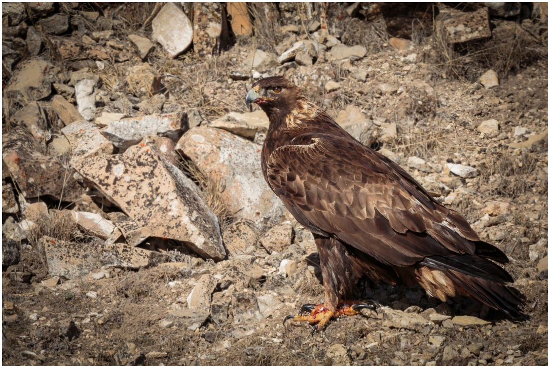
National Audubon Society Golden Eagle

https://www.memberplanet.com/s/eastcascadesaudubonsociety/ecasdonationform