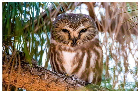
Northern Saw-whet Owl