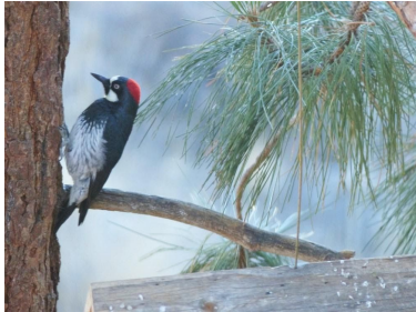
Acorn Woodpecker

If ever there was a grab-bag group of birds, the Near Passerines would fit the "bill." This group includes the cuckoos, nightjars, woodpeckers, and hummingbirds. A very rare YELLOW-BILLED CUCKOO was heard calling at Cold Springs C.G. on Sep 9 for only the second Central Oregon record (Crabtree). An ACORN WOODPECKER was spotted for a 12 th time in Deschutes County in a Bend yard on Oct 20 (Talbot) and a WHITE-HEADED WOODPECKER was noted in the town of Prineville for an "odd location" record (Halvorson). AMERICAN THREE-TOED WOODPECKERS are our rarest woodpecker and birds were found at Matthieu Lk. (Haynes), Hwy 242 past the winter gate (D.