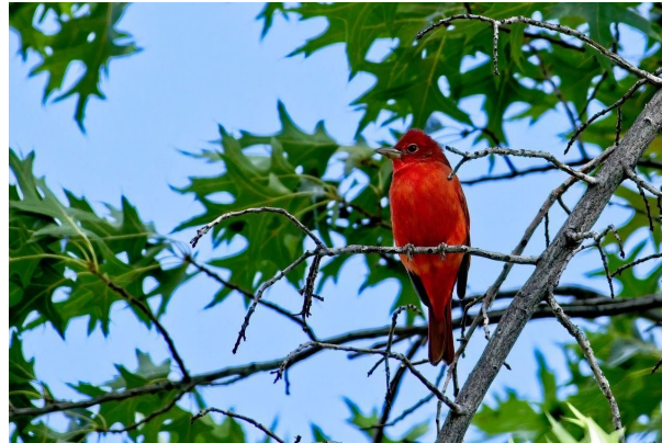
Summer Tanager