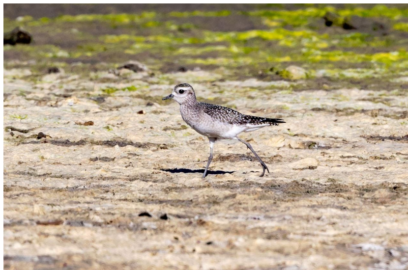
American Golden-plover