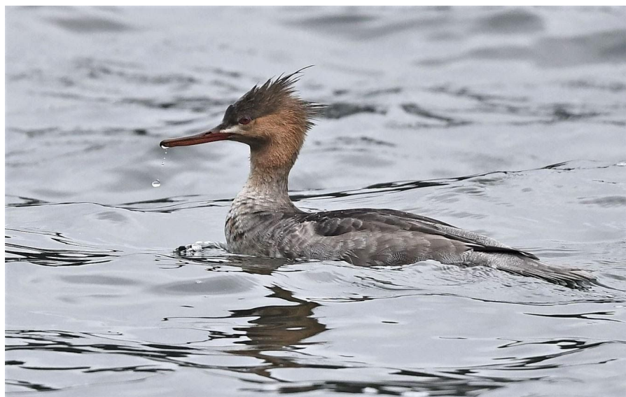
Red-breasted Merganser