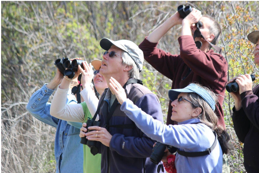
Intent Birders

These are birders. Most of the time they are recreational birders, out looking at birds for their own enjoyment. However, sometimes these exercises can be "official," such as conducting the Christmas Bird Count (CBC). The CBC — that's been going on for over 100-years — is one of the most important birding exercises in the US. It began with the Audubon Society and is what the entire birding community uses to determine the welfare of the birds of North America.