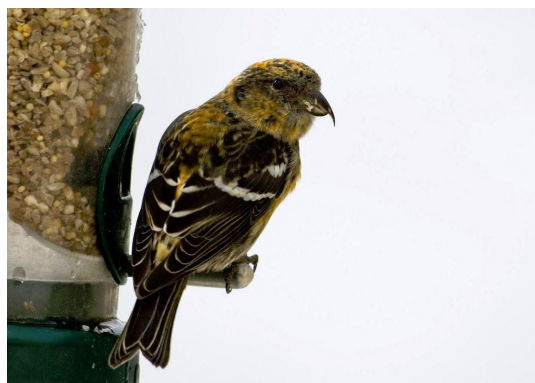
White-winged Crossbill

and it remained in the area for a couple of weeks (Murphy). A SWAMP SPARROW discovered at Hatfield Lk. on Oct 18 stayed through the season (Low) and a BLACK-THROATED SPARROW found at Smith Rock S.P. may have been a holdover from the pair that bred there this summer (Hopping). No fewer than 20 WHITE-THROATED SPARROW reports came from Deschutes County, but the real buzz came from Jefferson County where they are much more infrequently reported: Suttle Lk (Crabtree), Green Ridge (Low), Cove S.P. (Sanford), and two separate reports from Camp Sherman (Beall, Sivers). LAPLAND LONGSPUR reports were received from Hatfield Lk. (Low, Meredith) and the Crooked R. Wetlands (Cahill). Late BLACK-HEADED GROSBEAKS were found in Bend on Oct 5 (Crabtree), Redmond on Oct 13 (Lowe), and Powell Butte on Oct 17 (Gates). TRICOLORED BLACKBIRDS are somewhat expected in Crook County, but birds found in Culver provided a more unusual Jefferson County record (Meredith). Deschutes County's 3 rd record of RUSTY BLACKBIRD showed up in LaPine and stayed a few days (Rhodes, Crabtree). GRAY-CROWNED ROSY-FINCHES were spotted on Pilot Butte (Horvath, Fainberg), Brokentop (Cahill, Swiney), and Grizzly Mt. (Gates). Finally, 8 WHITE-WINGED CROSSBILLS were reported from Prairie Farm Sp. Oct 5 (Low) and another visited a feeder in Deschutes R. Woods on Nov 14 (Moodie).