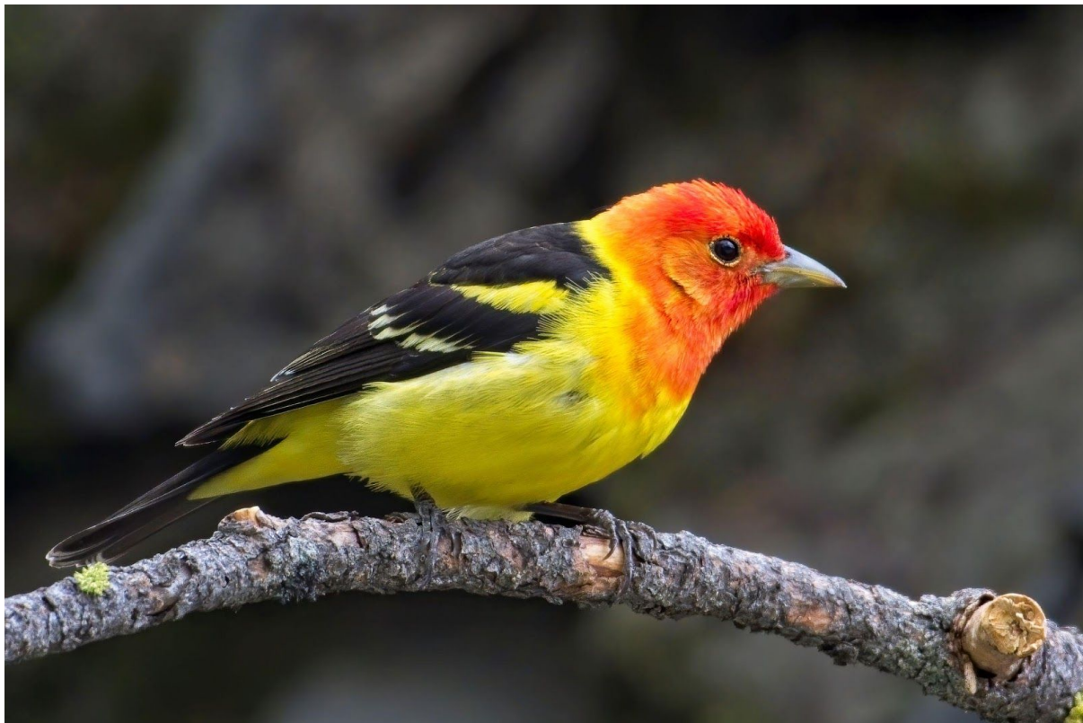
Figure 3. Male Western Tanager. Photo taken as the bird perched on the stick just for that purpose. I blew it when we had two (2!) male Bullock's Orioles come to the water feature when I attempted to slip out the door with my camera. Instead, I should have shot through the window. <Head slap>

In the past 18+ years of birding in the yard, I have added at least one new species each year, including four this year and it is only June! It has been a blast, and I suspect it will continue to be a great source of entertainment for years to come.