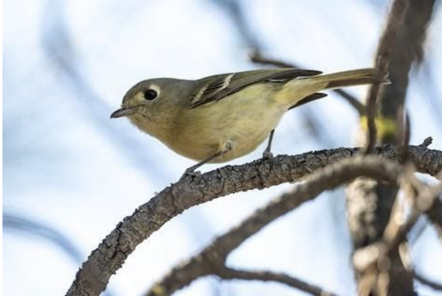
Hutton's Vireo Whychus Creek 3/10/20