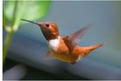
Rufous Hummingbird by Jim Moodie

If you want to bird beyond your property, you can set up a Patch ( https://ebird.org/site/patch ) to count all the species in your neighborhood, your regular walking route, etc. A popular type of patch birding is creating a five-mile radius (5MR) circle around some center point, like your property, and counting all the birds within the circle. What I like about yardbirding compared with patch birding is that I know that I can find a bit of time to yard bird, because I am already at my destination...right here.