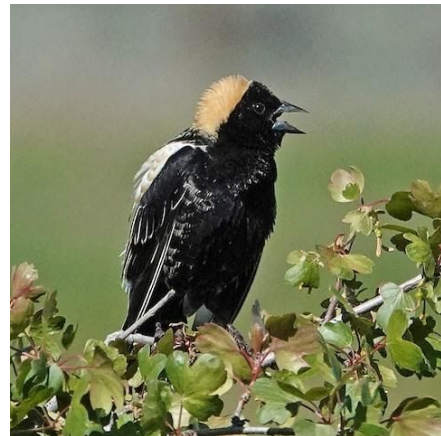
Bobolink Puett Road 5/28/20 Don Sutherland