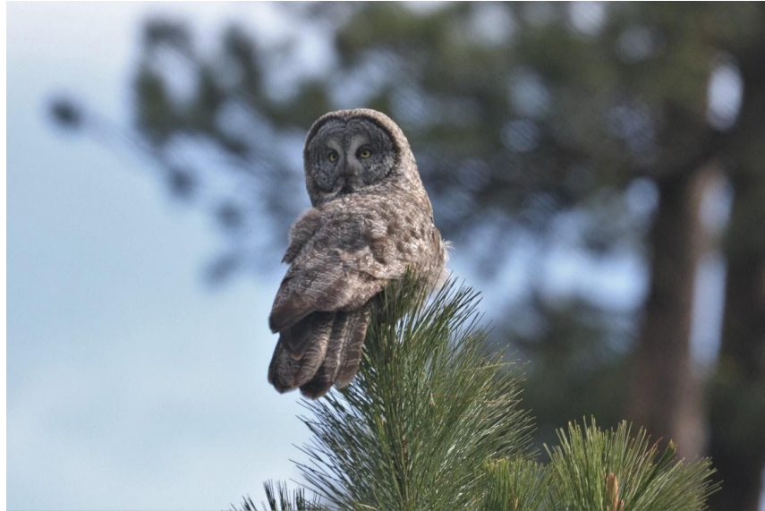
Great Gray Owl Ochoco Mountains 5/13/20