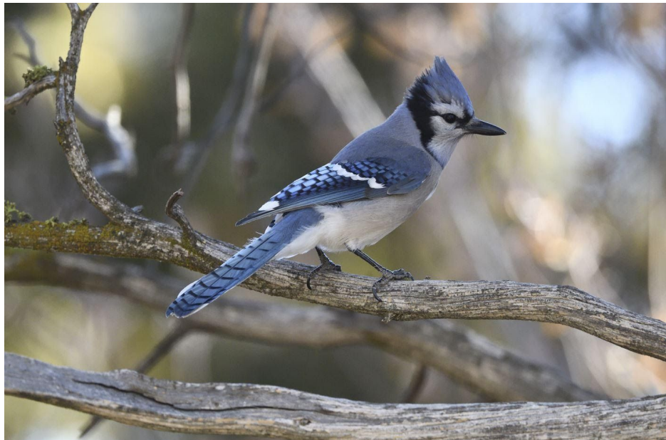
Blue Jay – Crouch Market Rd. Tumalo 3/10/20