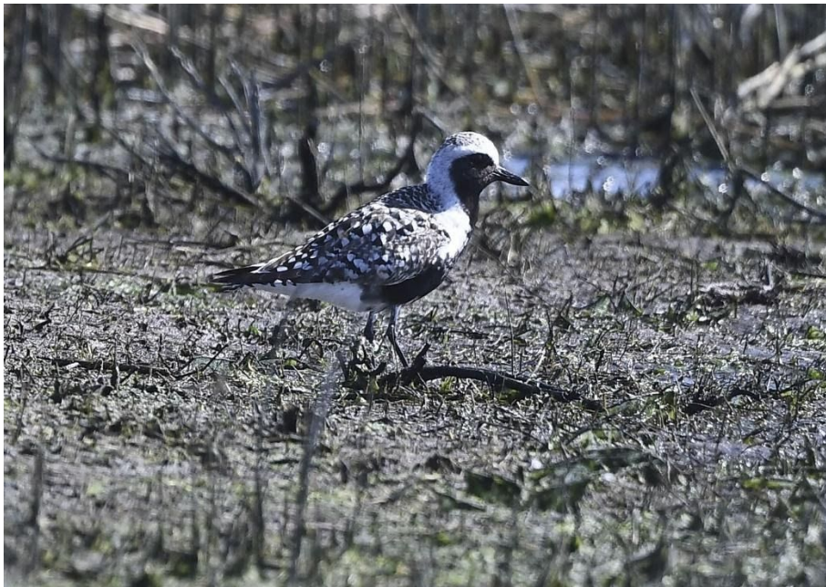
Black-bellied Plover – Hatfield Lake 5/5/20 Tom Crabtree

Shorebirds deserve their own paragraph away from the other "water birds". In spring, they are a highlight reel in and of themselves. A beautiful breeding plumaged BLACK-BELLIED PLOVER