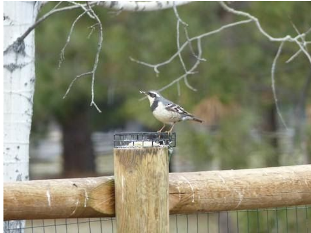
White Variant of Varied Thrush Camp Sherman 4/3/20 Janet Keen

winter on Couch Market Rd. in Tumalo was found throughout most of the spring as well (Cahill, Low). PINYON JAYS can be fairly regular in southwestern Jefferson County, but 25 birds found at the Pelton Re-regulation Dam were out of that normal range (Talbot). A rare white variant of