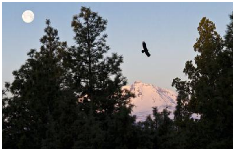
Petra soars near the nest, North Sister in the background

See all the comments at: www.goldeneaglecam.org/home/live-camera#comments