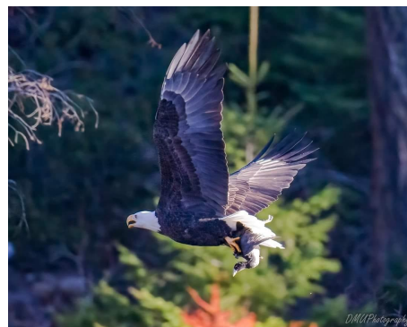
Bald Eagle with American Coot by Darrin Underwood on Suttle Lake