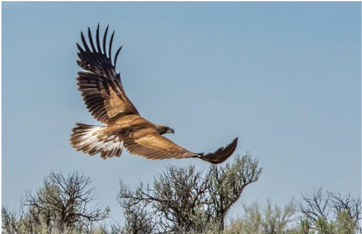
A Golden Eagle soars over Malheur National Wildlife Refuge.

Buteos: Red-tailed Hawks are by far the most common and variable hawk in Oregon, and can be found year-round in virtually every habitat in Oregon. They are frequently seen perched on utility poles looking for prey. Ferruginous Hawks are high desert residents most often found in sagebrush habitat and other open range, but can also be in agricultural fields during winter. Swainson's Hawks are strictly summer residents of wide-open spaces and farmlands. Red-shouldered Hawks are our smallest buteo, uncommon on the east side and quite shy, preferring tall vegetation or deciduous trees rather than open range.