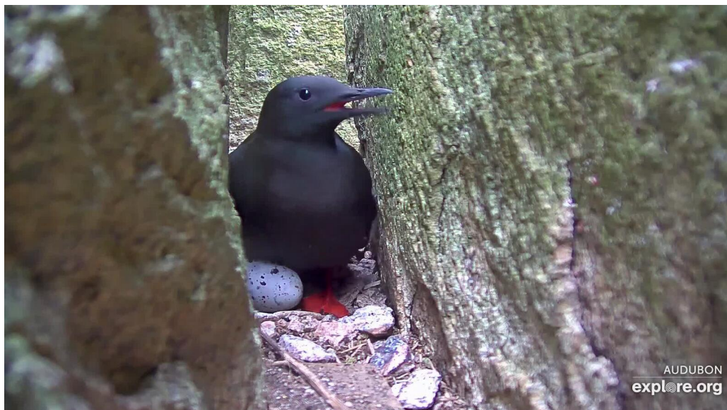
Black Guillemot Burrow Cam

The Guillemot burrow is the one to watch in 2024. Last year viewers observed a turf war in the burrow between a Black Guillemot pair and a pair of exploratory puffins. It remains to be seen who will claim the burrow as their own this coming season.