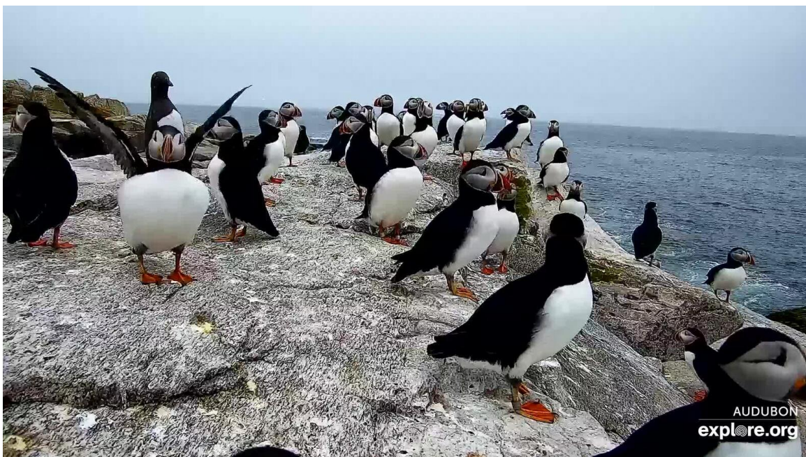
Atlantic Puffin Loafing Ledge

The Audubon Seabird Institute, in partnership with explore.org, makes it possible for you to watch puffins, razorbills, terns, and osprey find mates, build nests, socialize and raise their chicks during the spring and summer months.