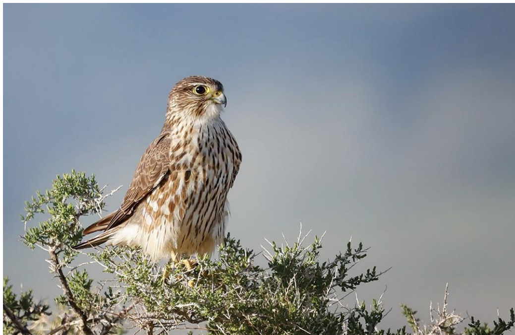
Categorized as falcons, Merlins are an uncommon raptor in Oregon's high desert. If spotted, they can be found in a wide variety of habitats from fall to early spring.