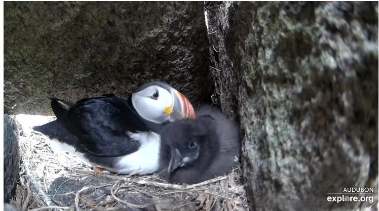
Atlantic Puffin Burrow Cam

Perhaps the most exciting live cams are those located inside Atlantic Puffin and Black Guillemot burrows. This past year, a returning Puffin pair welcomed a hatchling to the burrow in early June. The puffling earned a reputation for being an especially tough chick after fighting back against puffin intruders in the burrow. It fledged in early August. The Puffin Burrow Cam , Puffin Burrow Exterior View Cam , and Black Guillemot Burrow Cam are definitely the fan favorites, as they are able to give viewers a glimpse into the life of puffin and guillemot families raising their young.