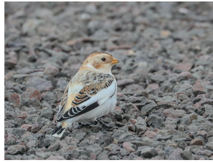
Snow Bunting by Chuck Gates at Crooked River Wetlands