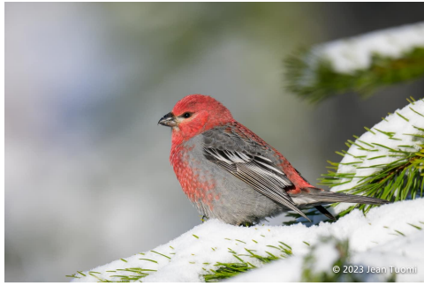
Pine Grosbeak near Santiam Pass