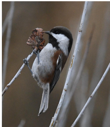
Chestnut-backed Chickadee by Sevilla Rhoads at Sunriver/Spring River confluence