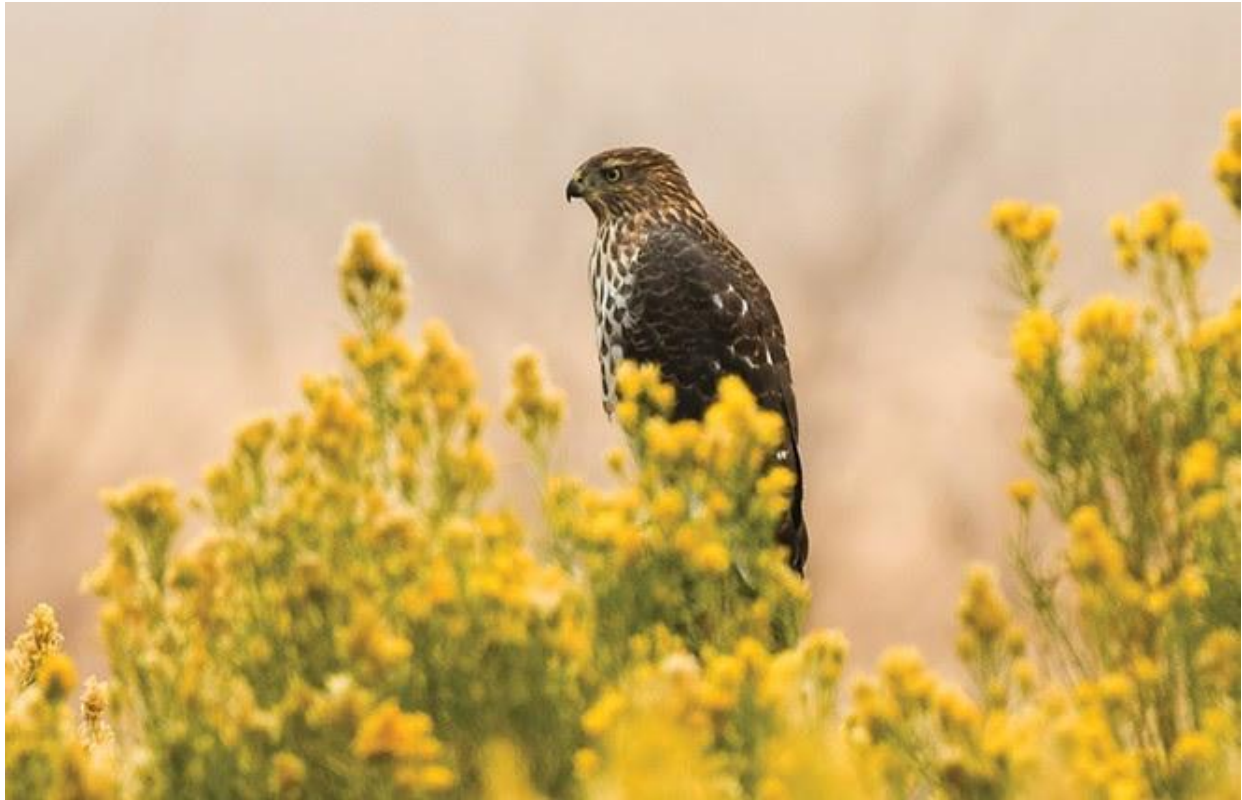
One of three accipiter species occurring in Oregon, Cooper's Hawks are birds of the forest, and their specialty is hunting small birds where there is a lot of vegetation.

fall to early spring. American Kestrels are our most common and smallest falcon. They feed primarily on small mammals such as voles, mice and shrews, as well as insects such as grasshoppers.